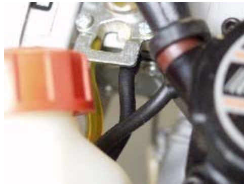
Fuel Line with "alligator surface" appearance

CPSC is still interested in receiving incident or injury reports that are either directly related to this product recall or involve a different hazard with the same product. Please tell us about it by visiting https://www.cpsc.gov/cgibin/incident.aspx