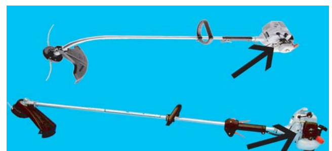
GT-200i, GT-200R, GT-201i, GT-201R, PE-200, PE-310, PE-311, PPF-210, PPF-211, SHC-210, SHC-211, SRM-210, SRM-210i, SRM-210SB, SRM-210U, SRM-211, SRM-211U, SRM-310, SRM-310S, SRM-310U, SRM-311, SRM-311S, SRM-311U, SRM-340 Serial Number Location

If your Echo tool is within the recall serial number range, contact Echo Incorporated for free repair of your tool. Call Echo's toll free number between 8:30 a.m. and 4:30 p.m. C.S.T. Monday-Friday at: (800) 432-3246