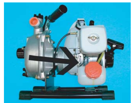
WP-1000 Serial Number Location