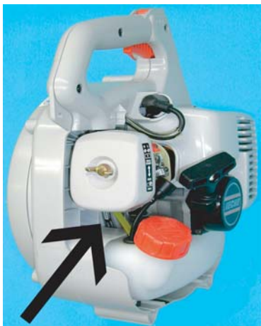
ES-210, ES-211, PB-200, PB-201 Serial Number Location