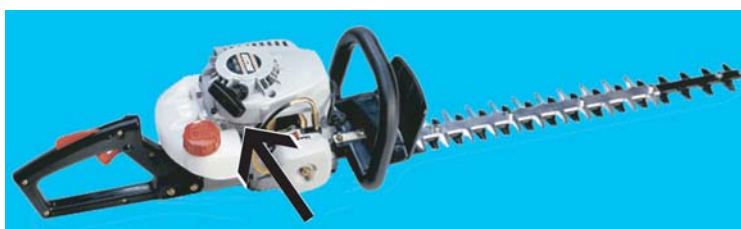
HC-150, HC-150i, HCR-150, HC-151, HCR-151 Serial Number Location